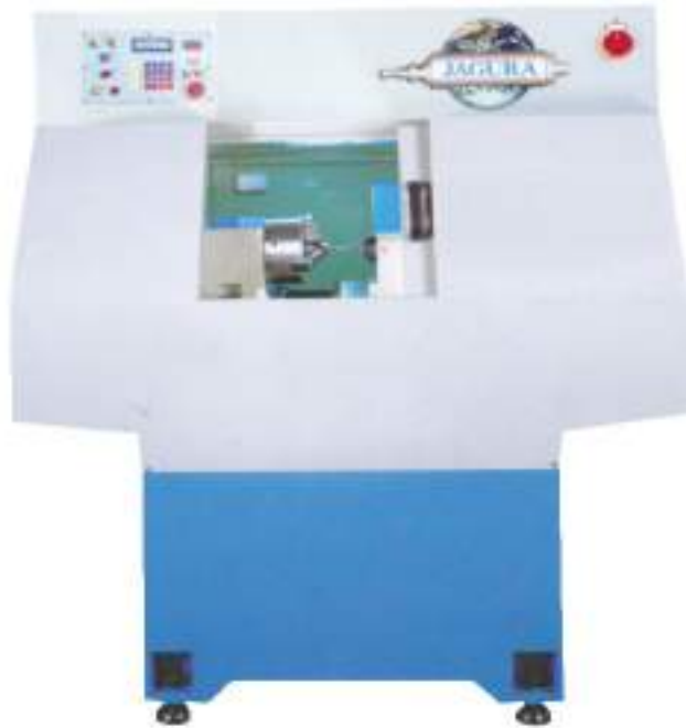
Precision Internal Grinding Machine