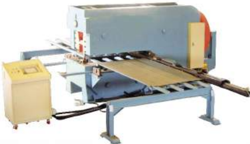
C Type Perforated Metal Machine