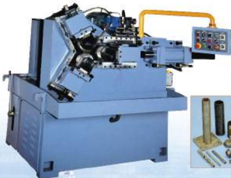
Hyd. Triple-Rolling Dies Thread Rolling Machine