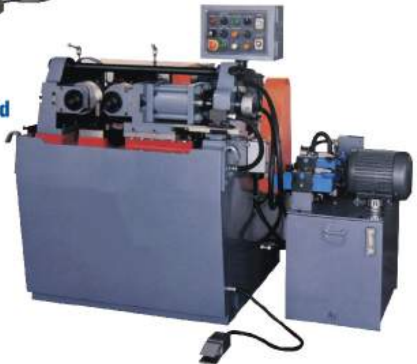
Hyd. Thru-Feed / In-Feed Combination Thread Rolling Machine