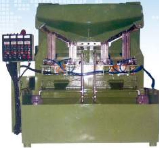
NUT TAPPING MACHINE