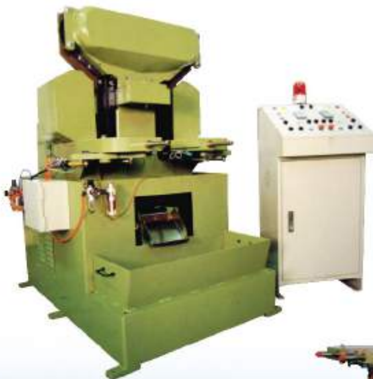
Two-Spindle Long Nut Tapping Machine