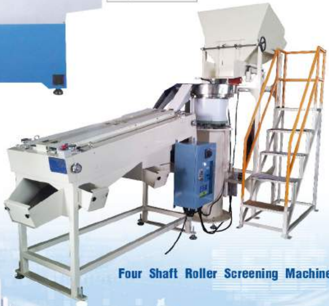
Four Shaft Roller Screening Machine