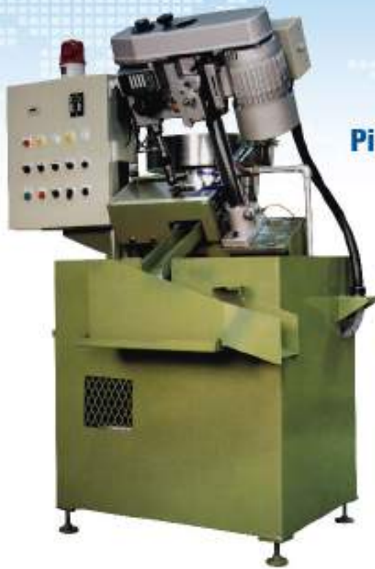
Pitch-Lead Type Vertical Single Spindle Tapping Machine